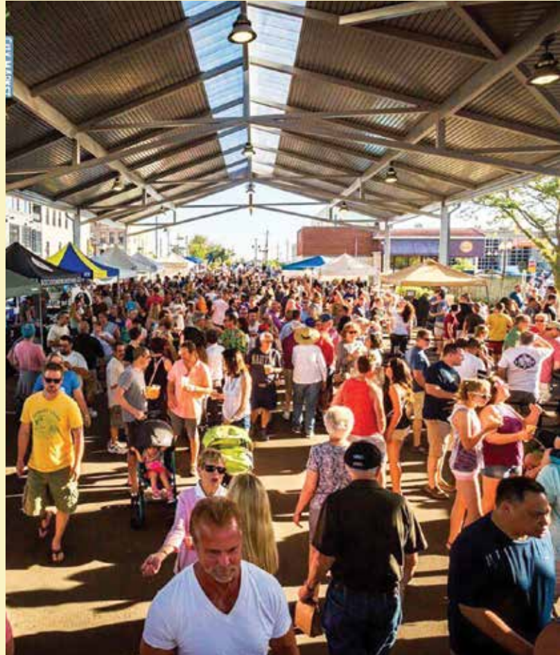
Hundreds attend the very popular downtown City Market held every Friday afternoon during the warm summer months.

Importantly, to those of us tied to nature, the region is close to woodlands, wetlands, and prairies that the Natural Land Institute has been acquiring, preserving, and restoring for years. One of NLI's strategies includes an exciting pilot project that introduces sustainable farming techniques on working farms, aided by several